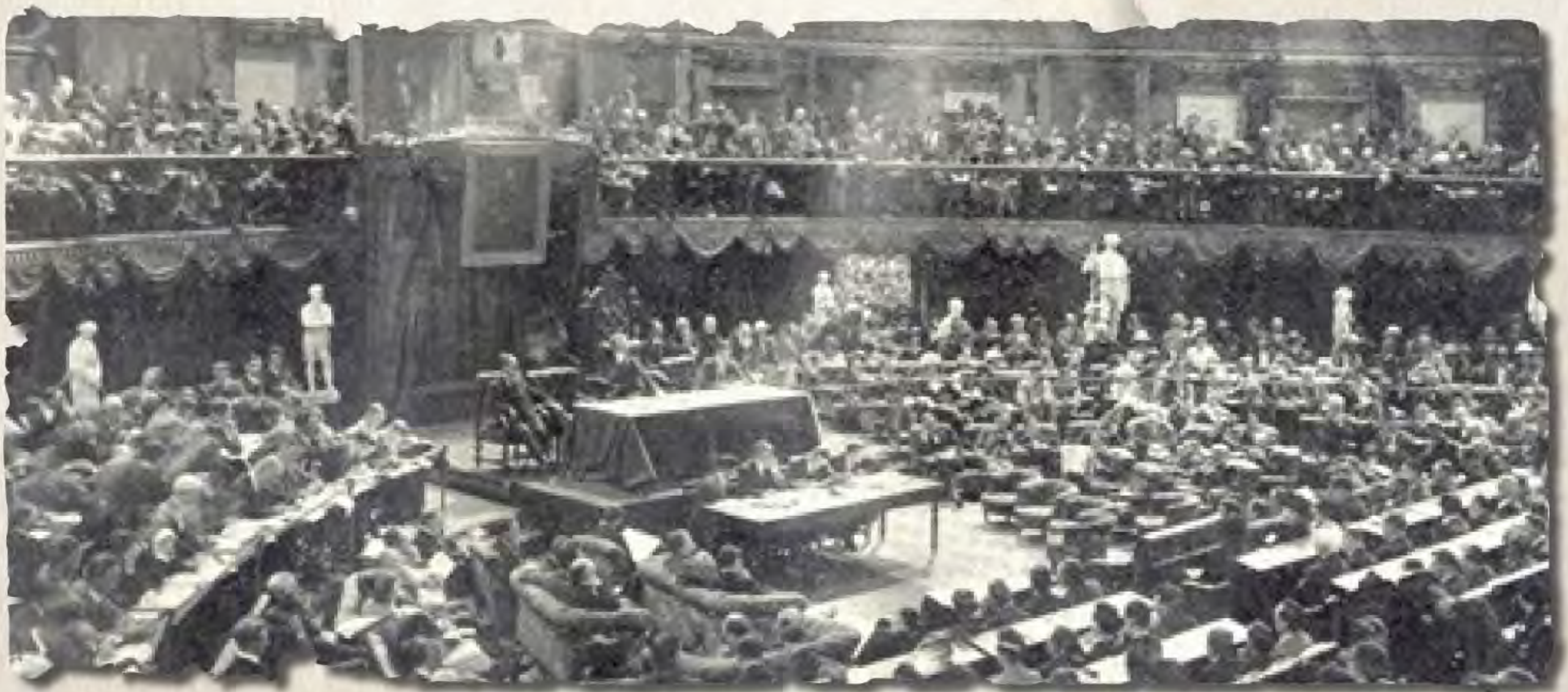
First Dáil in session, January 1919 in the Mansion House, Dublin

Adopted by Dáil Éireann, 21 January 1919